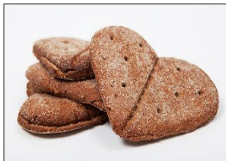
Ska Bakery's Scandia Heart Bread.

But no need to do that—you also can get Finnish rye right here in Atlanta! The Ska Bakery in Fayetteville bakes fresh rye bread once a week and you can get it at the bakery or order online at: www.skabakery.com . It is also for sale at the Georgia State Farmer's Market Welcome Center gift shop. When the Atlanta Finnish School is in session, you can pick up your order