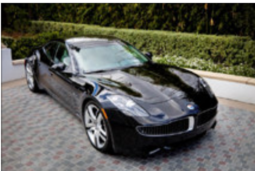
2012 Karma Eclipse.

Want to test drive the Karma? Try Classic Cadillac at 7700 Roswell Rd. ♦ (Sources: ABCNews.com, Wikipedia, etc..)